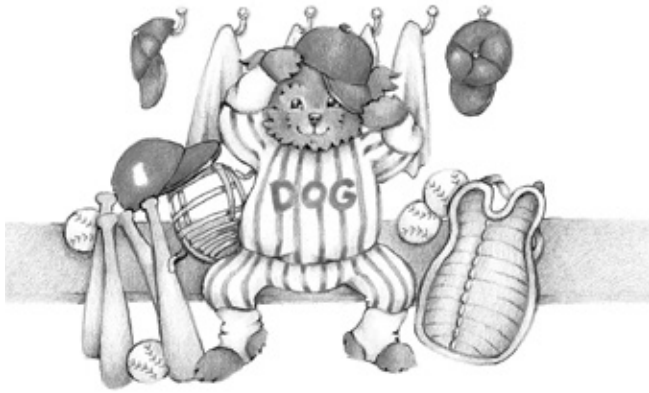
This is Tag.