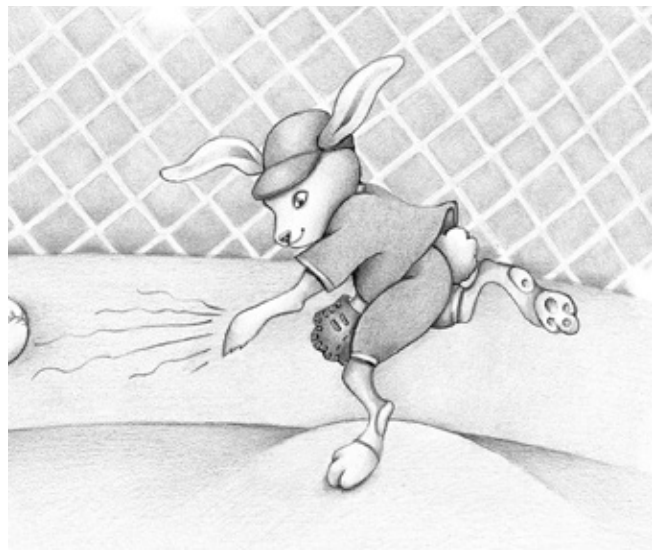
Here it is!