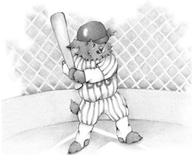
Hit, Tag, hit!