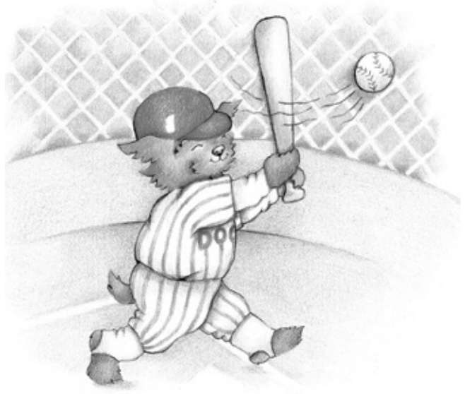
Tag hit it!